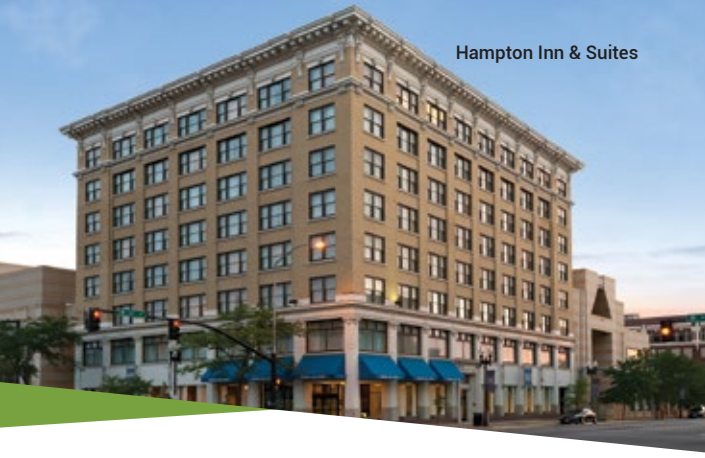
Hampton Inn & Suites