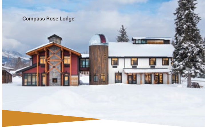
Compass Rose Lodge

Compass Rose Lodge compassroselodge.com 198 S 7400 E, Huntsville 385-279-4460