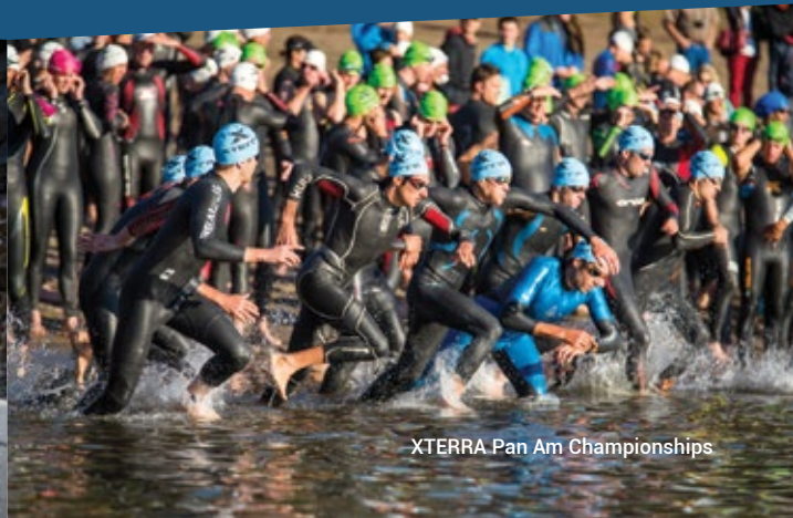
XTERRA Pan Am Championships