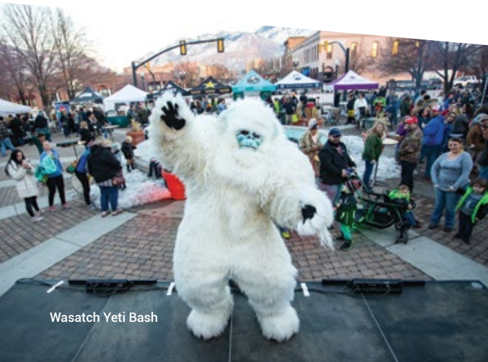
Wasatch Yeti Bash

Anyone can happily endure the cold and snow of early winter. Fresh snow, the holidays, and Christmas Village make it easy. However, by early February, cabin fever can start to set in and Ogden hosts the Wasatch Yeti Bash to encourage residents and visitors to bundle up, step outside and celebrate Winter. The event typically includes outdoor Yeti Yoga on Historic 25th Street, an art show, outdoor expo, s'mores, a beard competition and more. The Yeti Bash is the prelude to the Sweaty Yeti Fat Bike Race that occurs the following day. More information is available at yetibash.com .