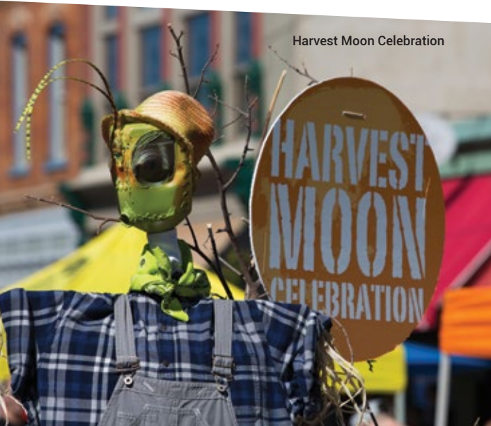
Harvest Moon Celebration

When Ogden's mountains are enjoying their most vibrant autumn colors, the annual Harvest Moon Celebration is how locals toast the end of summer and invite the upcoming ski season. This one-day event...typically the last Saturday in September...has become one of the city's biggest parties full of live music, outdoor dining, beer gardens, kids activities and more. Visit ogdendowntown.com to learn more.