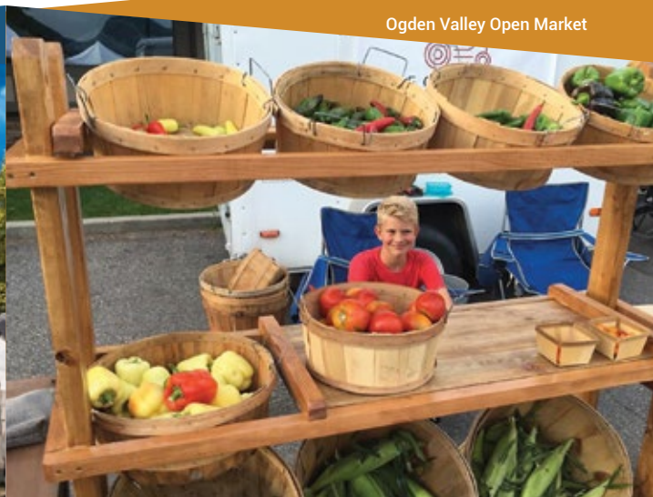
Ogden Valley Open Market

Market runs every Thursday July-September, 5:30pm - dusk! Farmers and artists earn fair prices for their labor by selling directly to the consumer. Consumers have access to fresh, nutritious and local produce. Eden creates a "town square" experience by shopping for specialty items in an animated, public atmosphere. More information is available at ogdenvalleyopenmarket.com