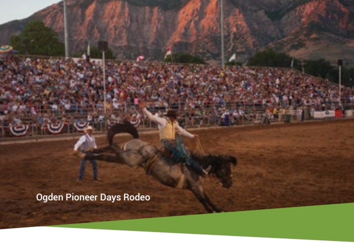
Ogden Pioneer Days Rodeo