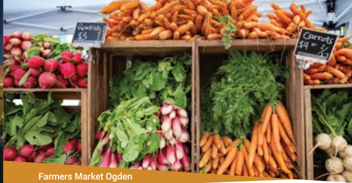
Farmers Market Ogden