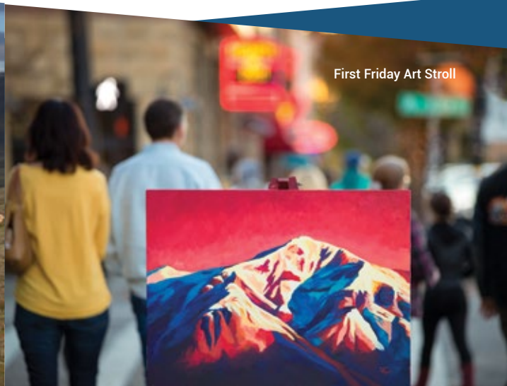
First Friday Art Stroll