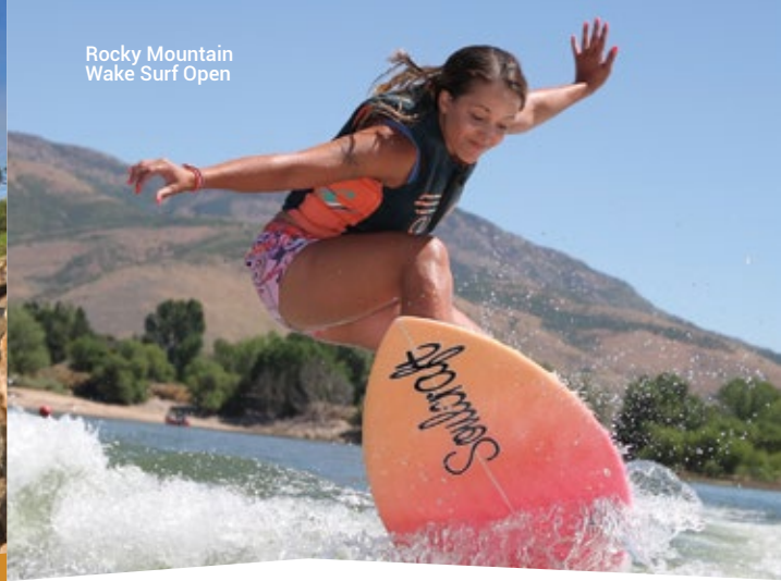
Rocky Mountain Wake Surf Open

Since its inception in 2001, the Ogden Marathon has grown to be one of the most popular marathons in the U.S. This Boston qualifier was voted "one of the Top 10 Marathons in the World" and "one of the best courses in America for first-time marathon runners" by Runners World . Billed as "Utah's Spring Run-Off," this world-class event typically takes place around the third weekend in May and includes full and half-marathon distances as well as a 5k and Kids K race. Complete information can be found at ogdenmarathon.com .