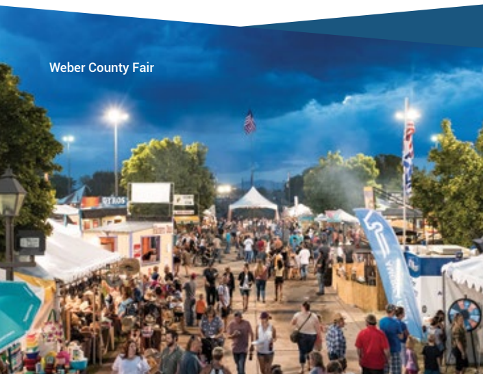
Weber County Fair

The Golden Spike Event Center is a year-round, multi-purpose public facility that provides a show place of activities for residents and visitors to Weber County. With over 300 different events annually, most weeks are filled with something different to do including: Weber County Fair, rough stock challenges, rodeos, equestrian events, the Hof German Fest, WeeBeer Festival, demolition derby, and many others. Complete event information is available at goldenspikeeventcenter.com.