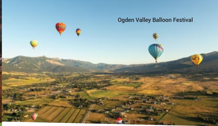
Ogden Valley Balloon Festival