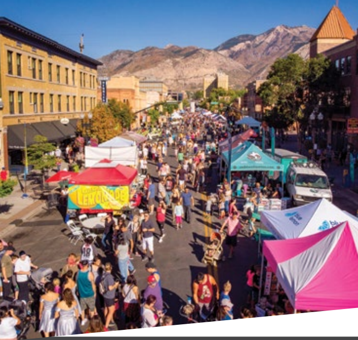
Harvest Moon Celebration

When Ogden's mountains are enjoying their most vibrant autumn colors, the annual Harvest Moon Celebration is how locals toast the end of summer and invite the upcoming ski season. This one-day event...typically the last Saturday in September...has become one of the city's biggest parties full of live music, outdoor dining, beer gardens, kids activities and more. Visit ogdendowntown.com to learn more.