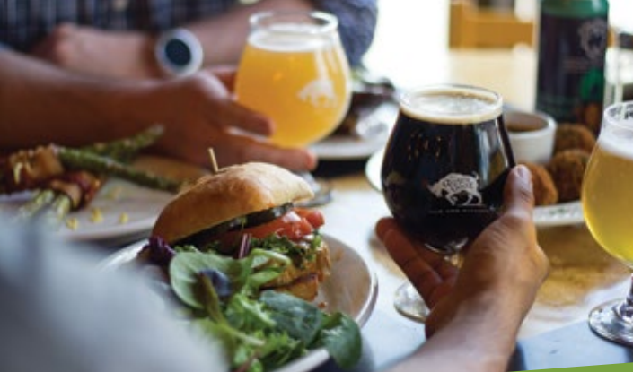
Ogden Restaurant Week at The Angry Goat